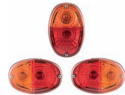
For recess mounting